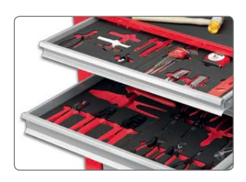
Tools organised according to area of application (screwdrivers, pliers, screwing tools etc.)