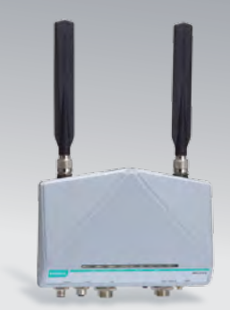
AWK-4131A Series IP68-rated industrial IEEE 802.11a/b/g/n wireless AP/ bridge/client